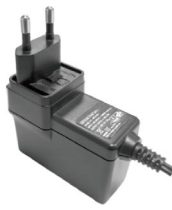
Size: 3.17" x 1.54" x 2.21"