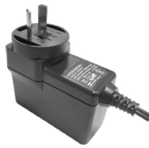
Size: 3.17" x 1.61" x 2.21"