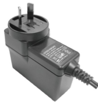
Size: 3.17" x 1.61" x 2.21"