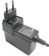
Size: 3.17" x 1.54" x 2.21"