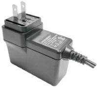
Size: 3.17" x 1.54" x 2.21"