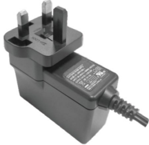
Size: 3.17" x 1.94" x 2.21"