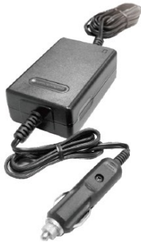
Size: 4.23in x 2.64in x 1.42in (107.5mm x 67mm x 36mm)