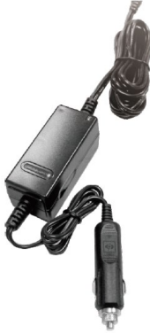
Size: 3.60in x 1.57in x 1.52in (91.5mm x 40mm x 38.5mm)