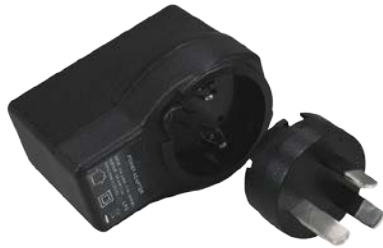
Size: 2.69in x 1.10in x 0.73in (68.5mm x 28mm x 18.55mm)