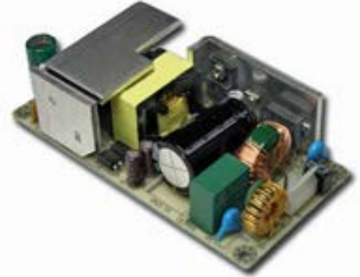
4(L) x 2(W) x 1.02(H) inches