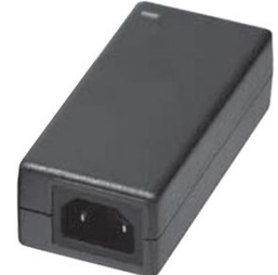
Size: 3.94 x 1.77 x 1.22 inches