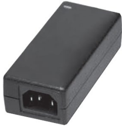
Size: 3.94 x 1.77 x 1.22 inches