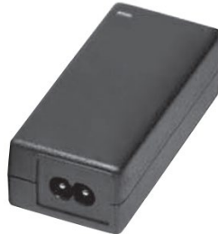
Size: 3.94 x 1.77 x 1.22 inches