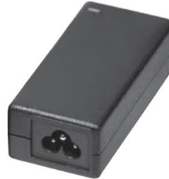
Size: 3.94 x 1.77 x 1.22 inches